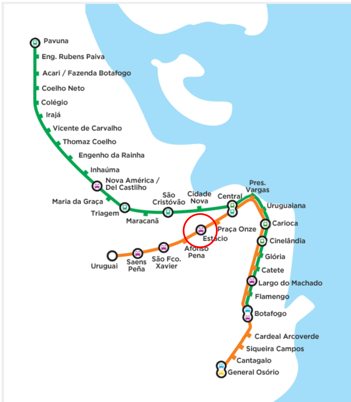
Fig. 1 – Metro lines – green: Line 2; dark yellow: Line 1 – Inside red circle Estacio Station

From the map, below, you can easily understand that to get to the Convention Center, you must take line 1 (General Osorio/Uruguai) and step out at ESTACIO Station. (Saturdays and Sundays, Metro only works with one line but the itinerary is the same.)